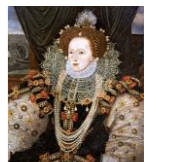
Queen Elizabeth I