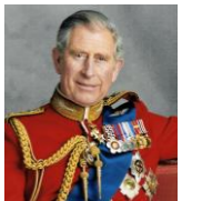
King Charles III

Lots of factories and machines were built and people's jobs changed.